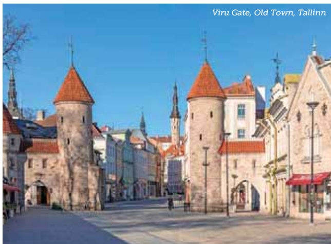
Viru Gate, Old Town, Tallinn