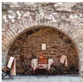
Old Town, Tallinn