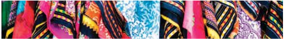
Vibrant traditional fabrics, Brixton market