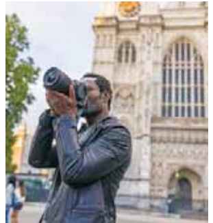
Photo op on walking tour

Knowledgeable Lecturers deepen your appreciation for the region and its history, culture and current events.