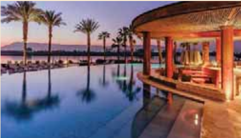
Hilton Luxor Resort & Spa | Luxor