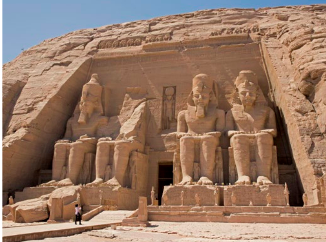
Temple of Ramses II, Abu Simbel