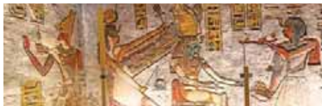
Hieroglyphics, Valley of the Kings