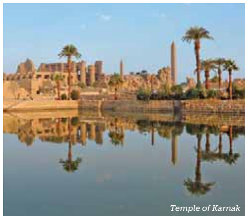
Temple of Karnak