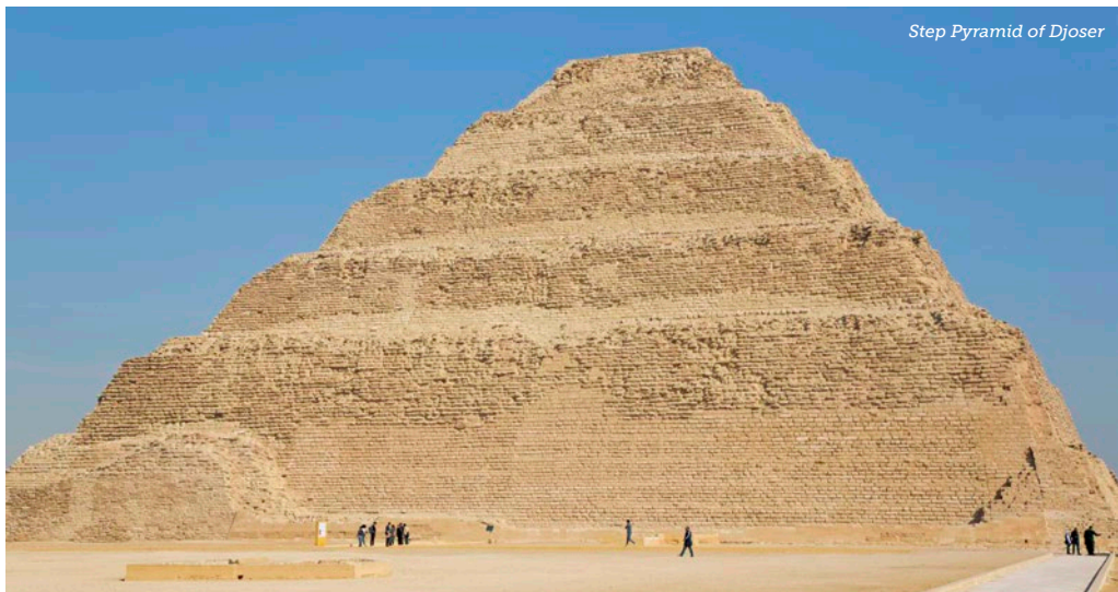
Step Pyramid of Djoser