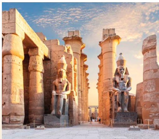
Temple of Luxor