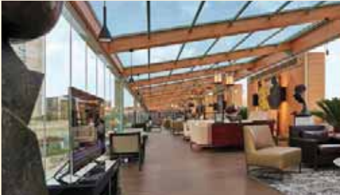
Four Seasons Hotel Cairo at Nile Plaza | Cairo