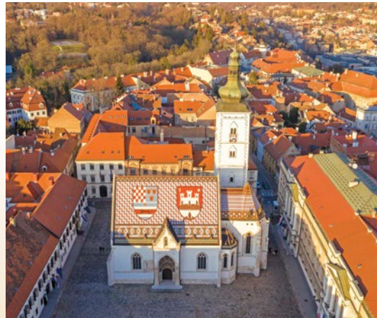
St. Mark's Church, Old Town, Zagreb

Vrboska & Winery. Learn about the local viticulture during a tour of a family winery. Enjoy a guided tasting of the family's legendary wines. Continue to the fishing town of Vrboska to see its fig-covered courtyards and pretty alleyways. Chat about your day during dinner at a local restaurant with a dazzling view.