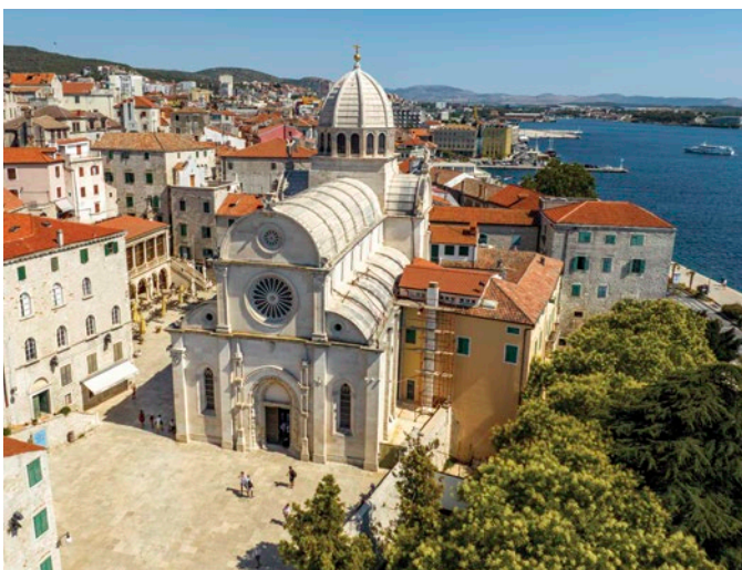
Above: Cathedral of St James, Šibenik | Below: Diocletian's Palace, Split