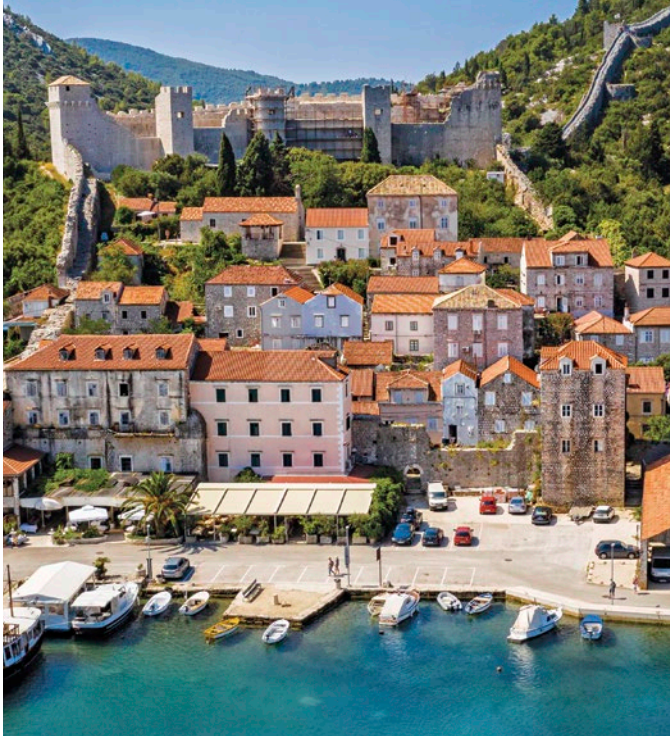
Mali Ston and the 14th century walls that link it to Ston