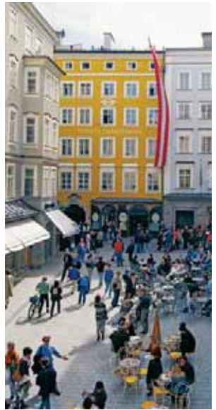
Mozart's Birthplace, Salzburg