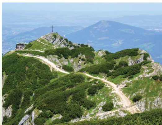
Eagle's Nest, Mount Kehlstein

Relish an authentic Austrian three-course dinner while listening to the melodic beauty and elegance of Mozart's music.