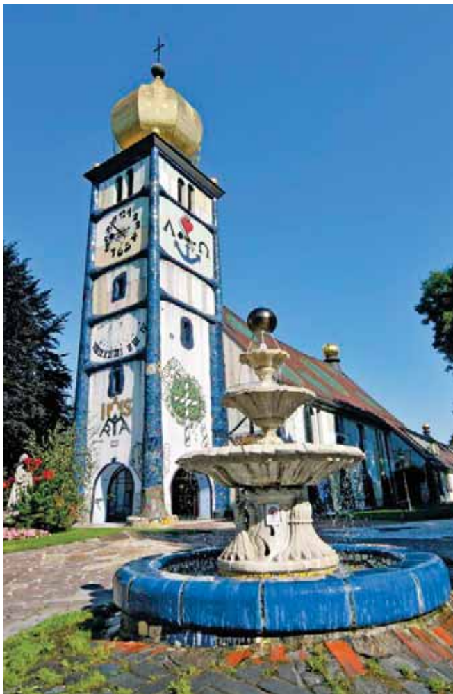
St. Barbara Church, Bärnbach