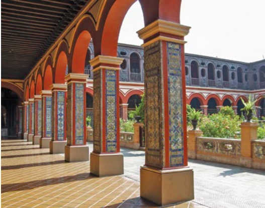
Monastery of Santo Domingo

Machu Picchu. Nestled in a cloud forest high in the Andes, the Lost City of the Incas is