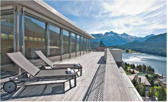
Hotel Schweizerhof | St. Moritz