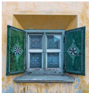
Charming Engadine architecture