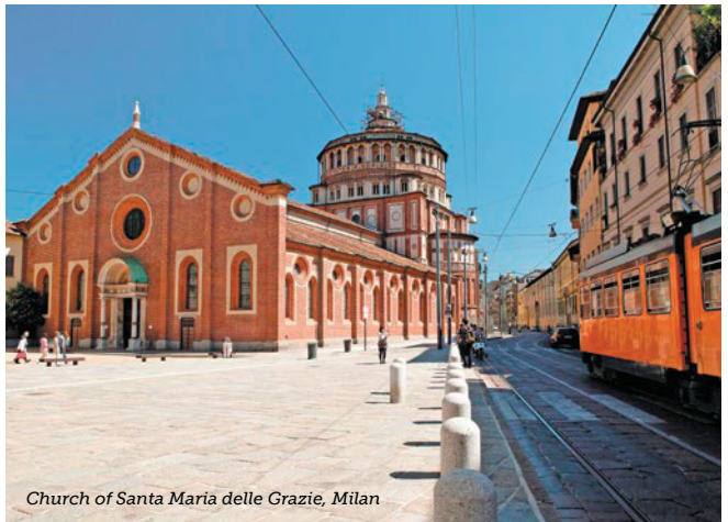
Church of Santa Maria delle Grazie, Milan