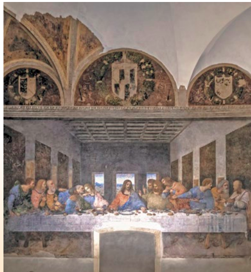
Leonardo da Vinci's "The Last Supper"