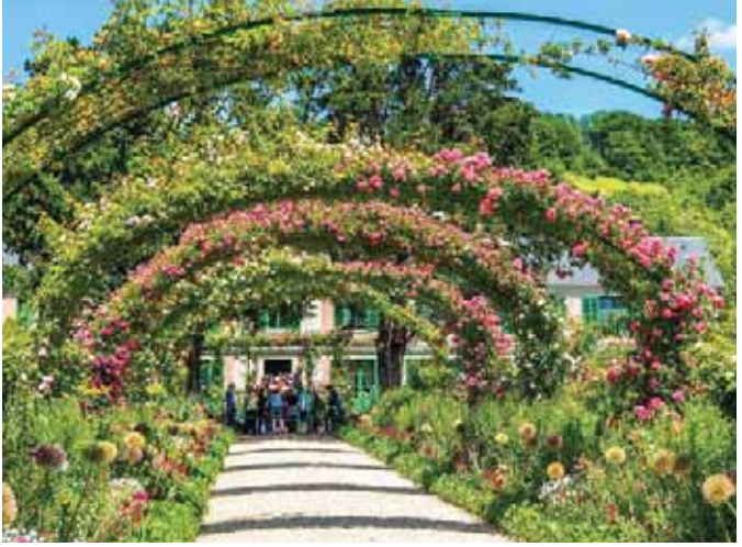
Home and gardens of Monet, Giverny