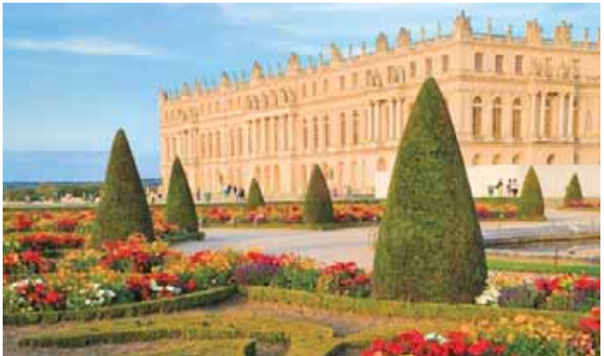
Sprawling gardens at Versailles