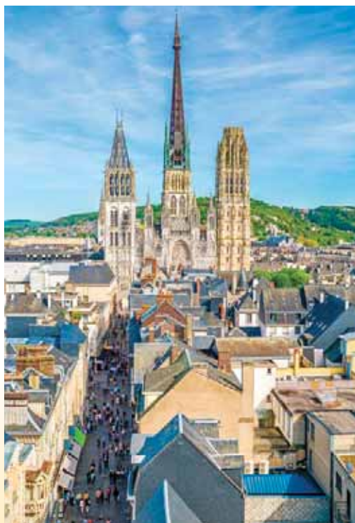
Notre-Dame de Rouen