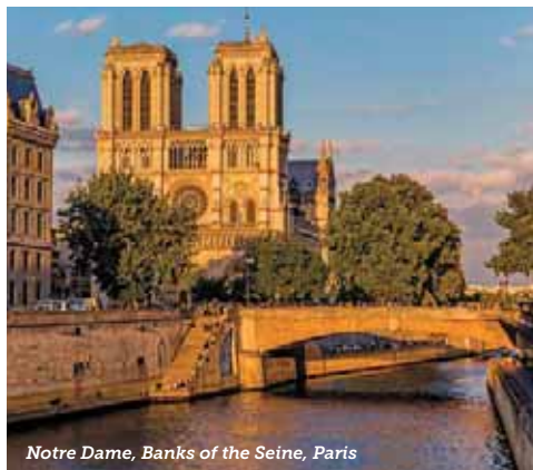
Notre Dame, Banks of the Seine, Paris