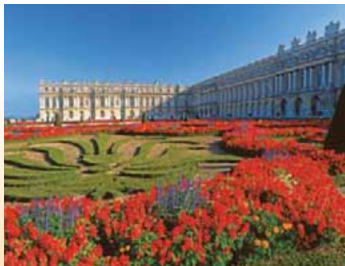
Gardens at Versailles