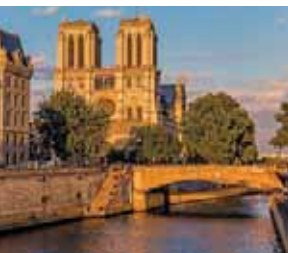
Notre Dame, Paris