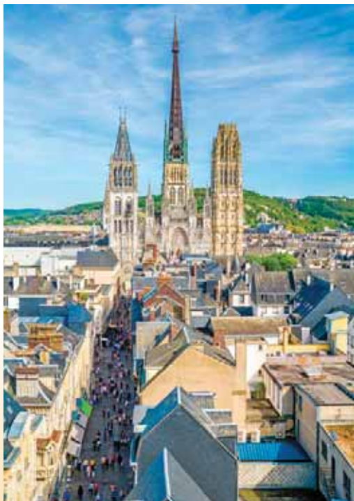
Notre-Dame de Rouen