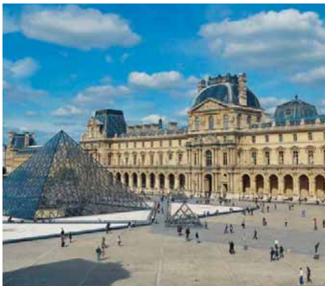
The Louvre, Paris