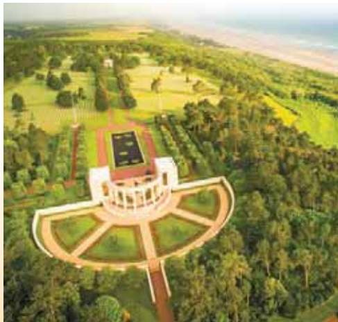
Normandy American Cemetery

Normandy & D-Day. Journey into World War II history at Pointe du Hoc. It was here that U.S. Rangers scaled cliffs to destroy German artillery emplacements that posed a threat to troops landing on Omaha and Utah beaches. Learn about this treacherous mission from your guide. At Omaha Beach, contemplate the bravery of the Allied landing forces who advanced under devastating fire across the heavily fortified shoreline to overcome German troops. Next, visit the Normandy American Cemetery, which contains 9,385 graves of Americans who died in the invasion and subsequent battles, followed by a touching visit to the Caen Peace Memorial Museum.