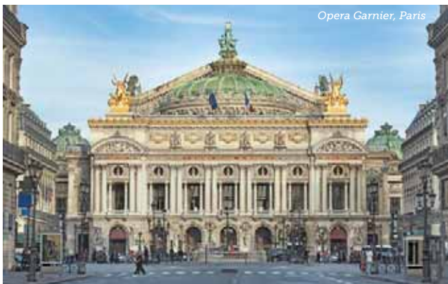
Opera Garnier, Paris