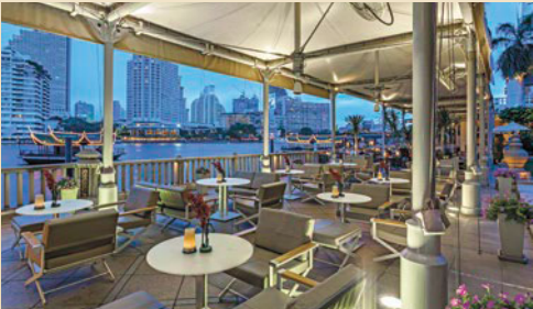
The Peninsula Bangkok | Bangkok