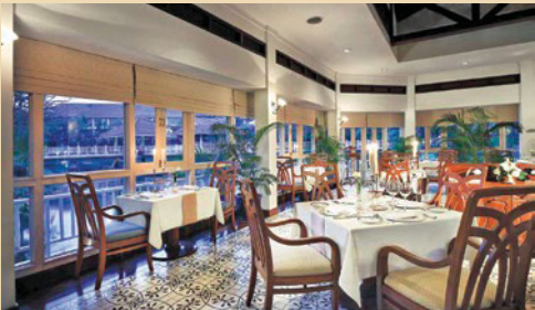
Sofitel Angkor Phokeethra Golf and Spa Resort | Siem Reap