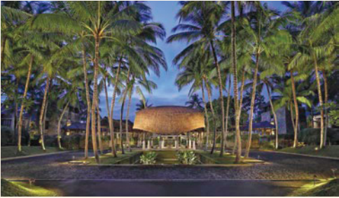
Maya Ubud Resort & Spa | Bali