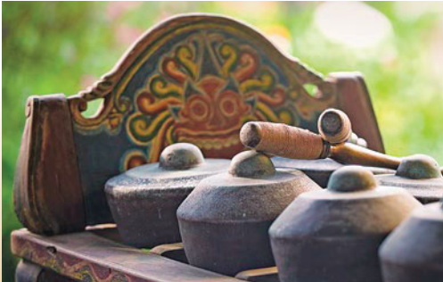
Left: Balinese gamelan | Below: Beaded baskets, market, Ubud

Enrichment: Contemporary Singapore. Singapore Highlights. On a panoramic tour, pass by the towering Marina Bay Sands resort, Merlion Park, the mythical Merlion statue and the Civic District. Visit the Thian Hock Keng Temple, Singapore’s oldest Chinese temple. Sample popular Singaporean dishes at lunch. Multicultural Singapore. Uncover Singapore’s diverse cultures and rich history. Drive through Kampong Glam, a Malay enclave that originated as a fishing village. Explore Chinatown and Little India’s vibrant flower and exotic spice markets.