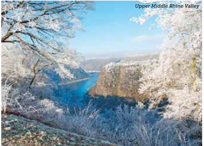
Upper Middle Rhine Valley