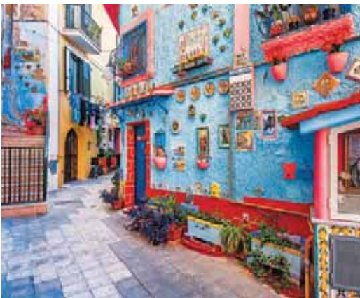
Colorful alleyways of Vietri sul Mare

Enrichment: The Horror and Splendor of Mount Vesuvius. Learn about the tragic effects of the eruption of Mount Vesuvius. This compelling talk provides context for tomorrow's visit to Herculaneum and Pompeii.