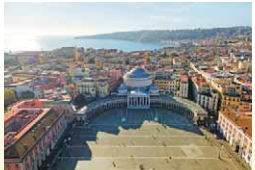
Piazza del Plebiscito, Naples

Energetic Naples, the capital city of Campania, welcomes visitors with a vivacious spirit. Gain insight into the ancient world at the Museo Archeologico Nazionale. The museum's galleries boast one of the largest collections of Greco-Roman artifacts in the world. Continue on a panoramic tour of Naples, taking in sprawling views of the city and the Bay of Naples from atop Posillipo Hill. Note the landmarks of Castel Nuovo, San Francesco di Paola, Teatro di San Carlo and Piazza del Plebiscito.