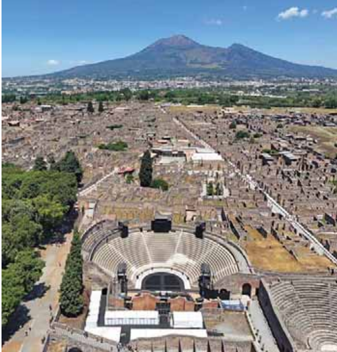
Mount Vesuvius overlooking Pompeii