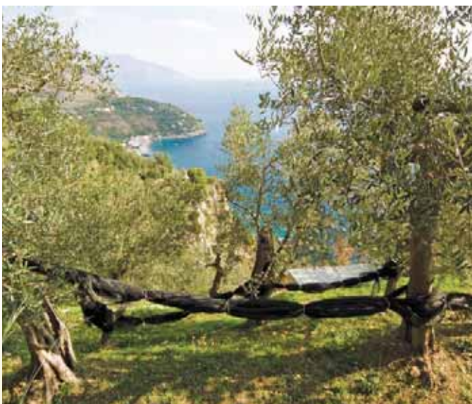
Olive farm near Sorrento