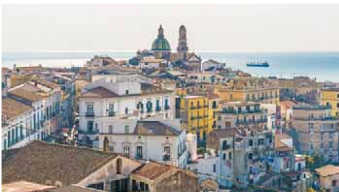
Vietri sul Mare