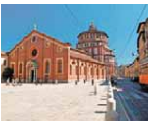
Santa Maria delle Grazie

Church and Dominican Convent of Santa Maria delle Grazie with "The Last Supper" by Leonardo da Vinci