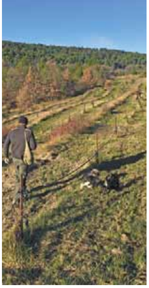
Hunting for truffles, Truffle farm, Les Pastras