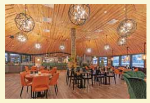
Northern Lights Village | Saariselkä