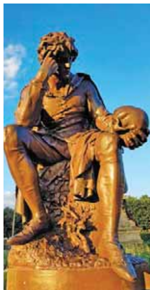
Hamlet Monument, Stratford-upon-Avon

Knowledgeable Lecturers deepen your appreciation for the region and its history, culture and current events.