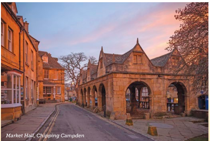
Market Hall, Chipping Campden