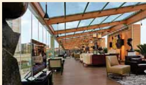
Four Seasons Hotel Cairo at Nile Plaza | Cairo