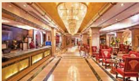
Sonesta St. George Hotel Luxor | Luxor (Rooms renovated in 2025 | Updated images coming soon)