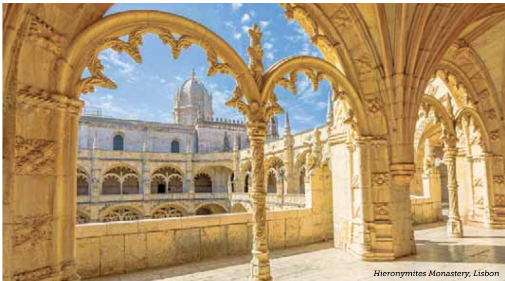
Hieronymites Monastery, Lisbon