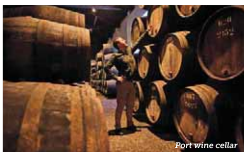
Port wine cellar

Continue to a port wine cellar for a wine tasting. (Active)