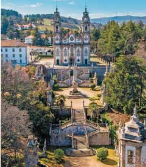
Nossa Senhora dos Remédios, Lamego