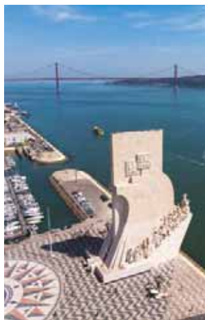
Monument to the Discoveries, Lisbon