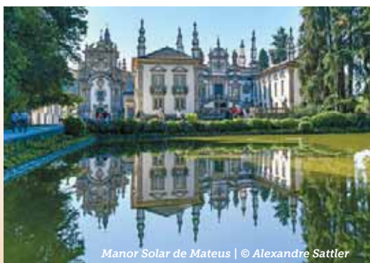
Manor Solar de Mateus