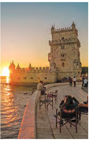
Belém Tower, Lisbon