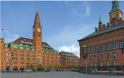
Scandic Palace Hotel | Copenhagen