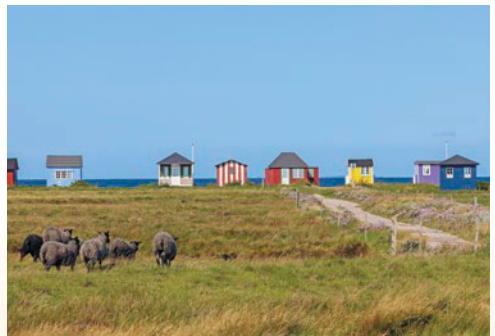
The shoreline of Vesterstrand Beach on Ærø Island is dotted with charming, traditional beach huts, treasured properties that are often handed down from generation to generation.

Silkeborg. Take a guided walk in this vibrant town nestled in Denmark's lush Lake District, and visit the Silkeborg Museum, notable for the remarkably well-preserved Tollund Man and Elling Woman from the fifth century B.C. Savor smørrebrød, traditional Danish open-faced sandwiches, for lunch at a restaurant.