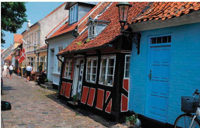
Historic houses of Ærøskøbing