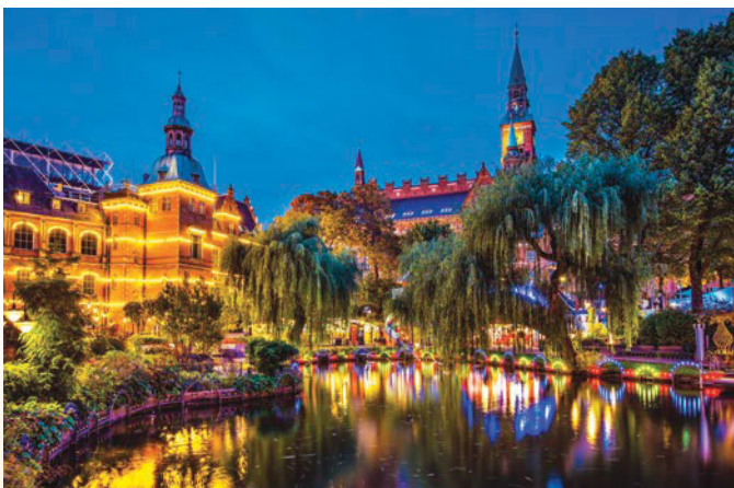
Tivoli Gardens, Copenhagen