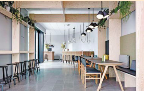
Comwell Aarhus — Dolce by Wyndham | Aarhus