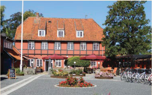
Hotel Ærøhus | Ærøskøbing