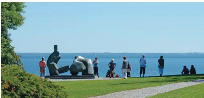
Sculpture Park, Louisiana Museum of Modern Art