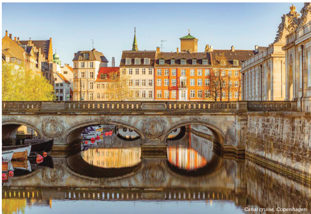
Canal cruise, Copenhagen