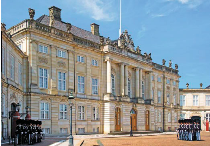
Amalienborg Palace, Copenhagen