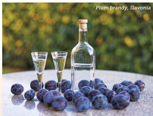
Plum brandy, Slavonia