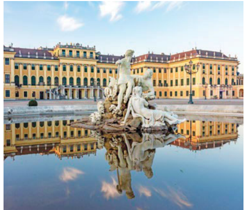
Front facade of Schönbrunn Palace