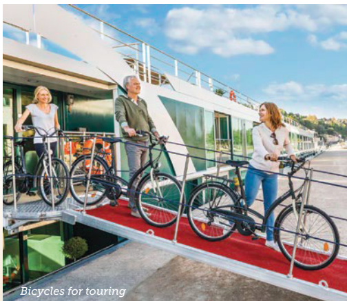
Bicycles for touring