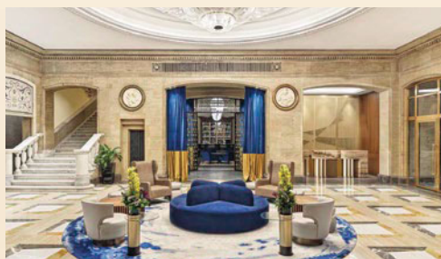
Sofia Hotel Balkan | Sofia