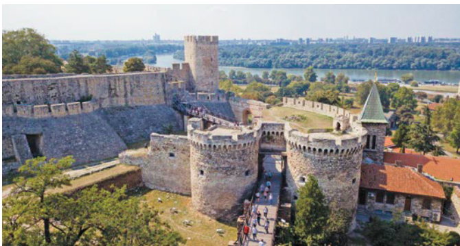
Belgrade Fortress, Serbia