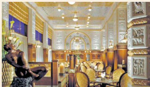
Art Deco Imperial Hotel | Prague