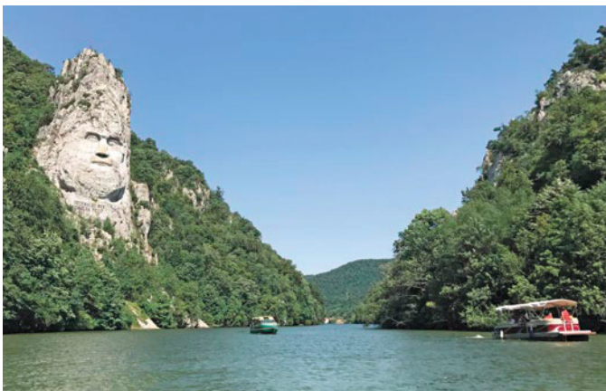
Rock sculpture of Decebalus, Iron Gate Gorge