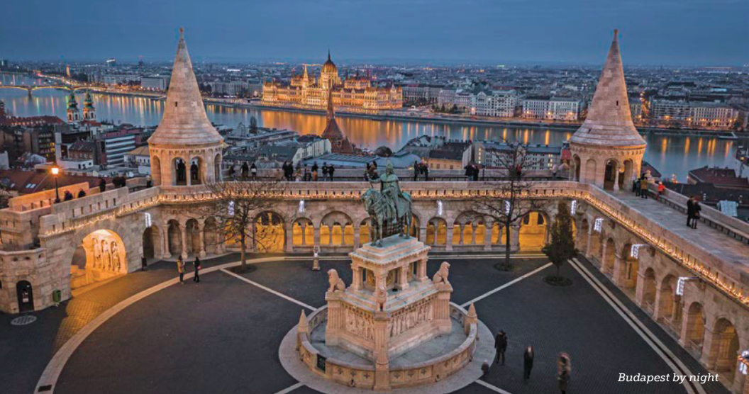
Budapest by night