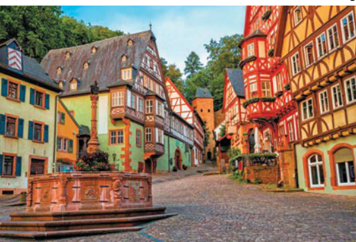
Half-timbered homes, Miltenberg