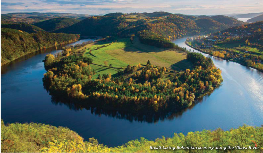
Breathtaking Bohemian scenery along the Vltava River