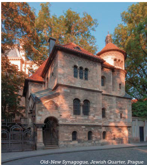
Old-New Synagogue, Jewish Quarter, Prague