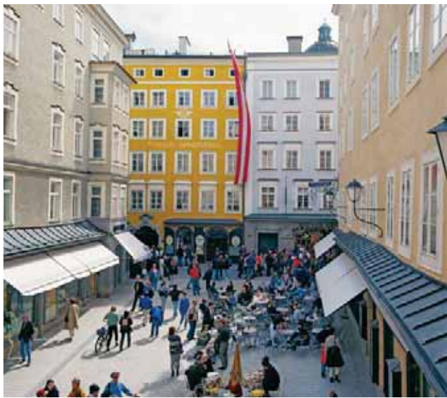
Mozart's Birthplace, Salzburg