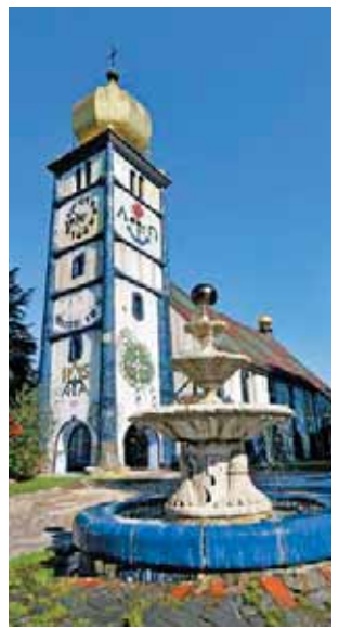
St. Barbara Church, Bärnbach