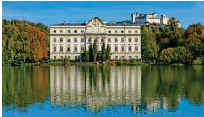
Leopoldskron Palace, one of the filming locations of "The Sound of Music"