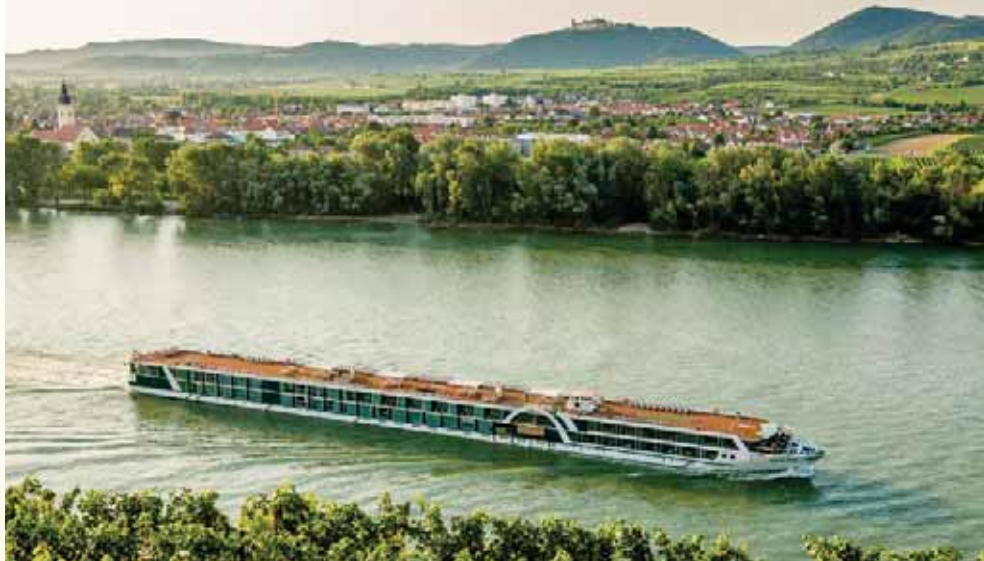
MS Amadeus Queen