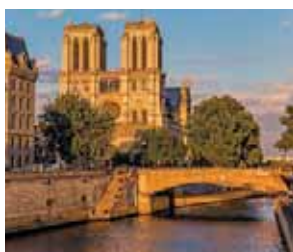
Notre Dame, Paris