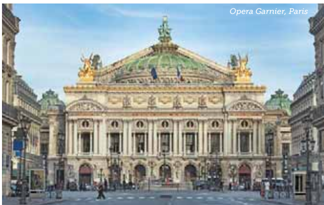
Opera Garnier, Paris