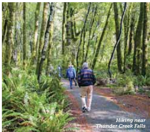
Hiking near Thunder Creek Falls