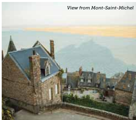
View from Mont-Saint-Michel