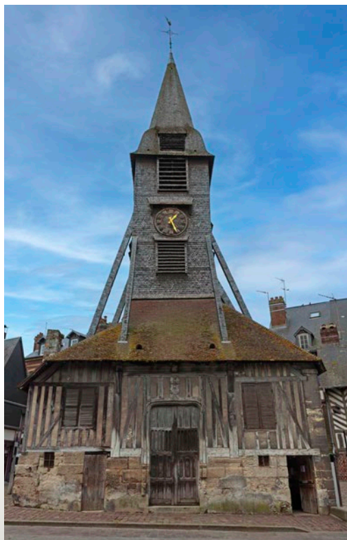
Church of Sainte Catherine, crafted by 15th-century shipbuilders