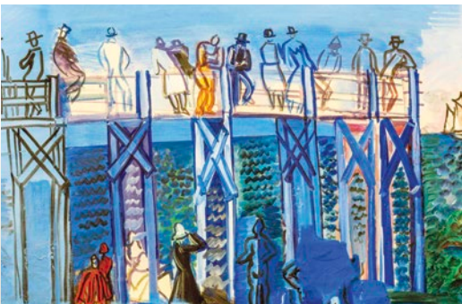
The Pier and the Beach at Le Havre, Raoul Dufy (1926) MuMa, Le Havre