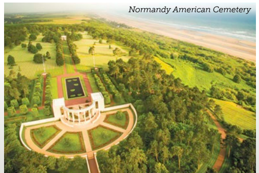
Normandy American Cemetery

Then, in Colleville-sur-Mer, pay a poignant visit to the Normandy American Cemetery. Set on a beautiful bluff overlooking Omaha Beach, the cemetery contains 9,385 graves of Americans who died in the invasion and subsequent battles, as well as a tranquil memorial garden honoring those missing in action.