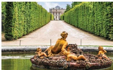
Above: Seine River, Paris | Below: Versailles Palace garden