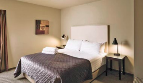
Carnmore Chateau Marlborough | Blenheim ●●●●●