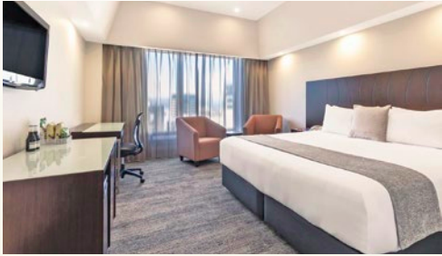
James Cook Hotel Grand Chancellor | Wellington ●●●●●