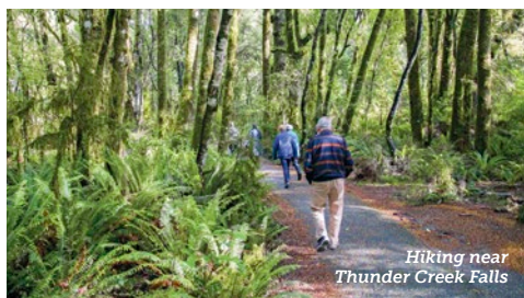
Hiking near Thunder Creek Falls

All members of HSU's community—alumni, families, friends—and like-minded travelers are welcome to explore the world with HSU's Traveling Range Riders.