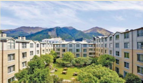
Millennium Hotel Queenstown | Queenstown