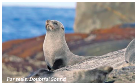
Fur seals, Doubtful Sound

All members of HSU's community—alumni, families, friends—and like-minded travelers are welcome to explore the world with HSU's Traveling Range Riders.