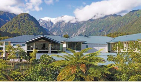
Scenic Hotel Franz Josef Glacier | Franz Josef