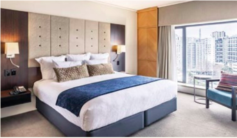
Grand Millennium Auckland | Auckland ●●●●●