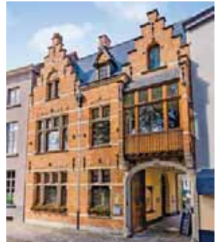
De Halve Maan Brewery, est. 1856, Bruges

Knowledgeable Lecturers deepen your appreciation for the region and its history, culture and current events.