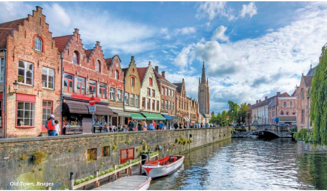
Old Town, Bruges

• Gouda – City of Cheese. See the bustling market square and the 15th-century town hall before admiring the exquisite, 16th-century painted-glass windows inside Sint Janskerk. Finish with a tasting of fresh Gouda cheeses.