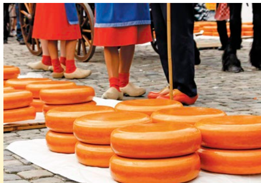
Gouda cheese, Gouda