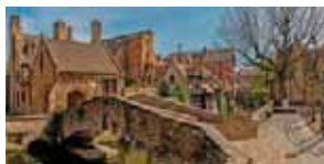
Old Town, Bruges