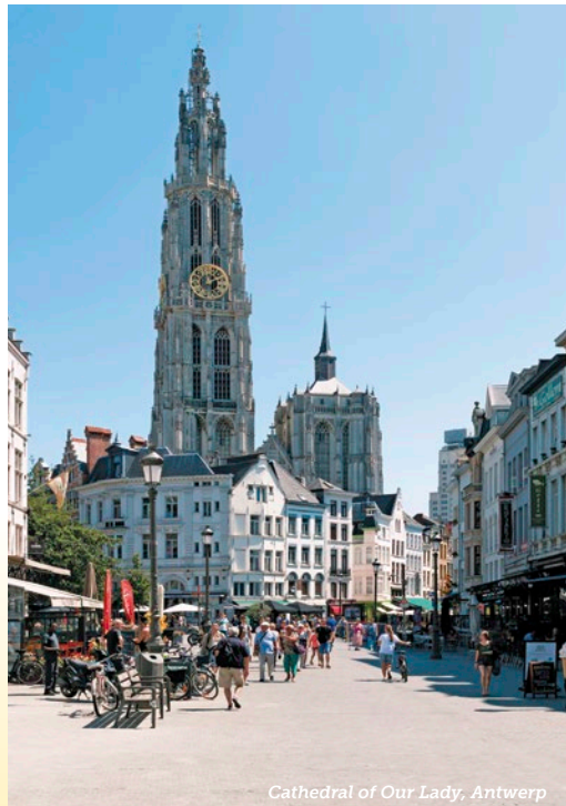
Cathedral of Our Lady, Antwerp