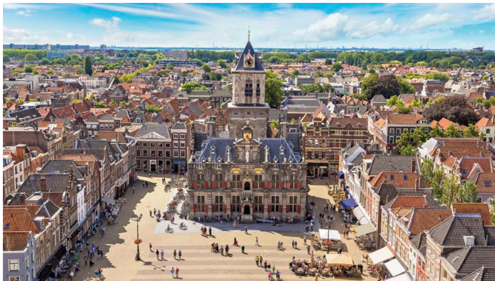
Old Town, Delft