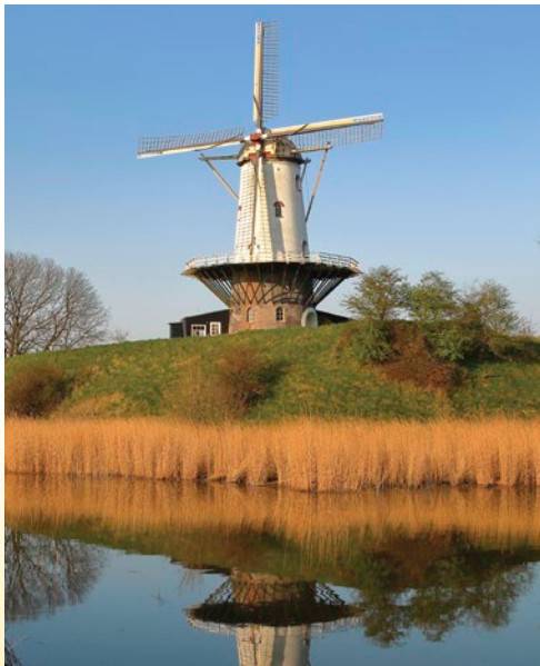
Windmill near Veere

landmass below sea level. Then, experience the impact of the devastating 1953 North Sea flood in a gripping, 4D panoramic animation. The ship remains in Veere overnight.