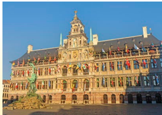
Town Hall, Antwerp