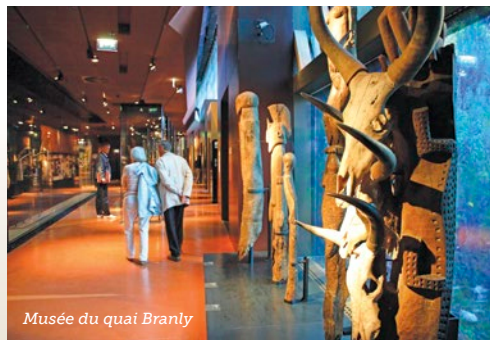
Musée du quai Branly

Free Time: After a group lunch, indulge in fine