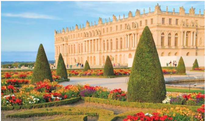
Sprawling gardens at Versailles