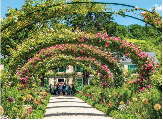
Home and gardens of Monet, Giverny