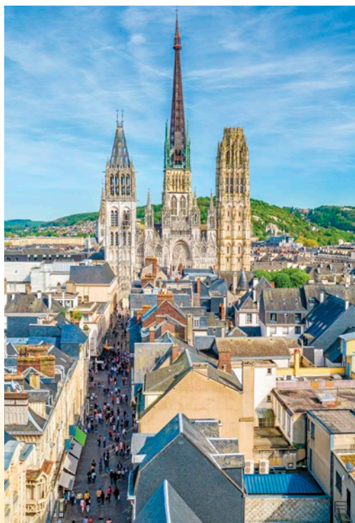
Notre-Dame de Rouen