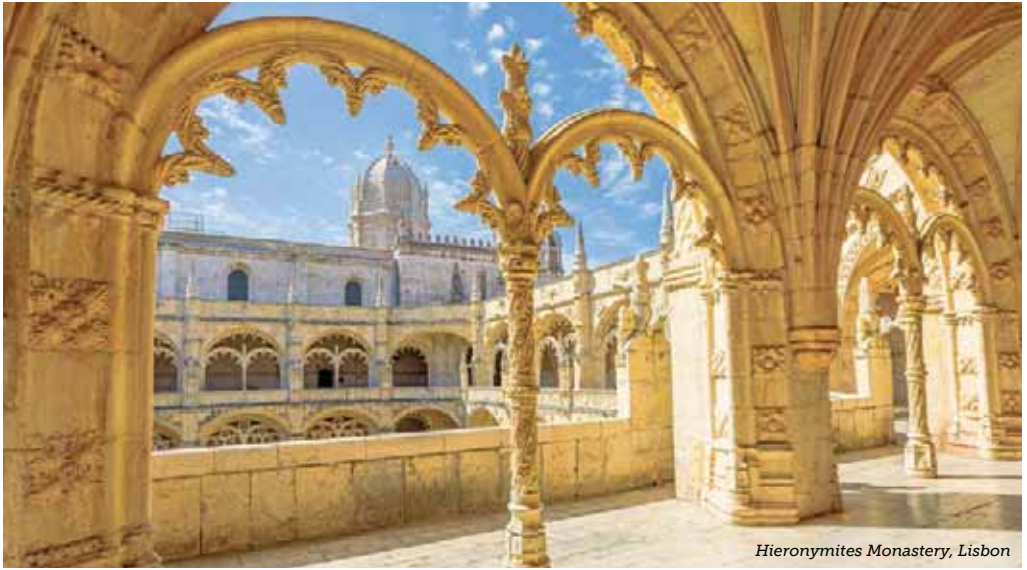
Hieronymites Monastery, Lisbon