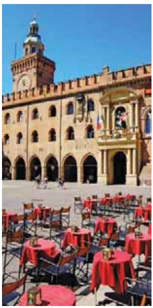
Piazza Maggiore, Bologna