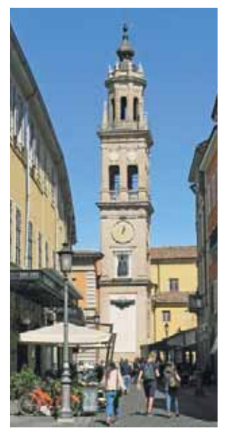
Clock tower, Parma