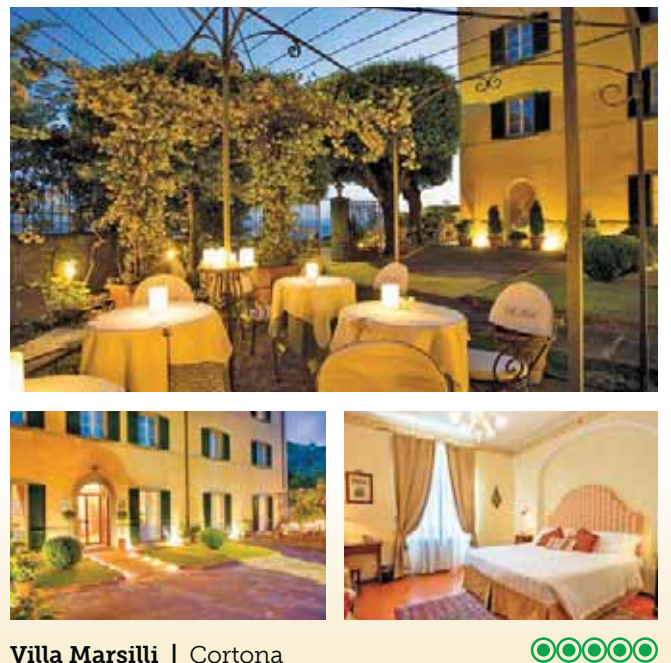
Villa Marsilli | Cortona