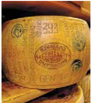
Parmesan cheese, Parma