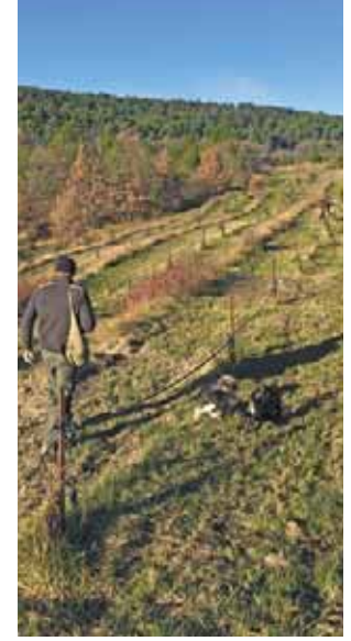
Hunting for truffles, Truffle farm, Les Pastras

Knowledgeable Lecturers deepen your appreciation for the region and its history, culture and current events.