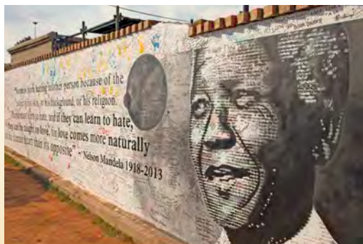
Nelson Mandela mural, Soweto