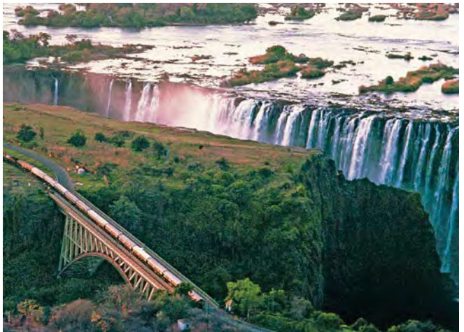
Rovos Rail, Victoria Falls