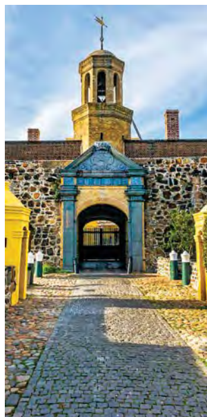
Castle of Good Hope, Cape Town

Knowledgeable Lecturers deepen your appreciation for the region and its history, culture and current events.