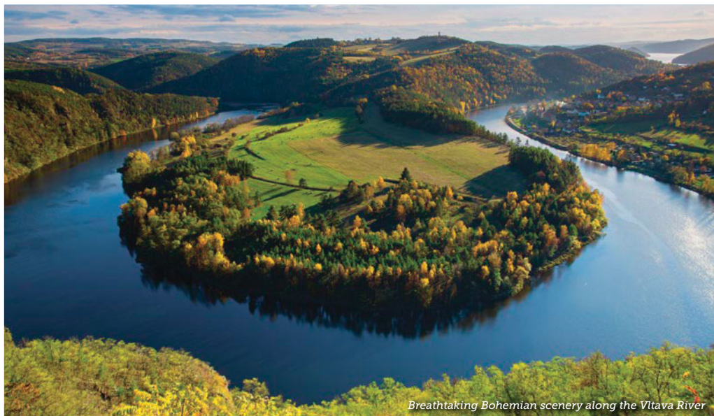
Breathtaking Bohemian scenery along the Vltava River