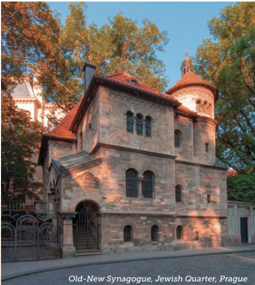
Old-New Synagogue, Jewish Quarter, Prague