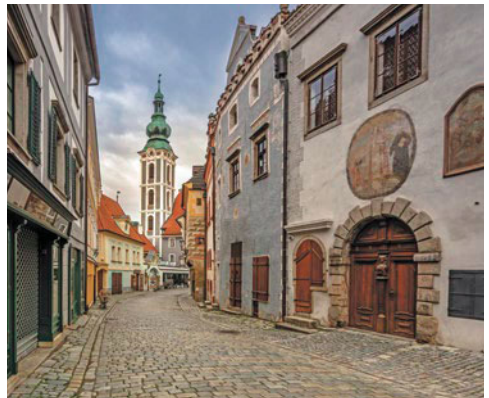
Left: Mineral spring, Karlovy Vary | Above: Český Krumlov