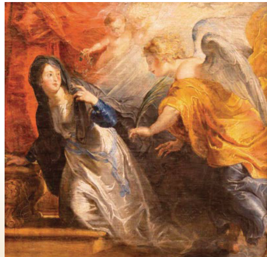
"Annunciation" by Peter Paul Rubens, Castle Gallery, Prague

Dresden City Tour. Travel to Dresden for a panoramic motor coach and walking tour of the city's treasures. Marvel at castles across the Elbe River and the landmark Blue Wonder cantilever truss bridge. Drive through the posh Weisser Hirsch neighborhood, the Albertplatz public square and along King's Street in the elegant baroque quarter. Alight the coach at Theater Square in the old town and set out on a guided stroll of the historic royal district. See the Church of Our Lady, the Royal Castle and the Royal Catholic Cathedral; and behold the baroque Dresden Zwinger complex and the historic Taschenbergpalais Hotel. Then, visit either the Green Vault in the Royal Palace or the Old Masters Gallery in the Zwinger Palace.