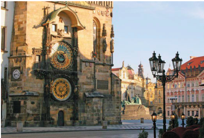
Medieval Astronomical Clock, Old Town Square, Prague