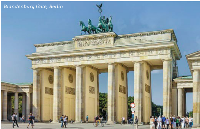
Brandenburg Gate, Berlin