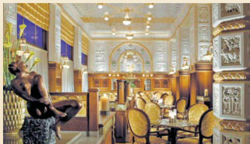
Art Deco Imperial Hotel | Prague