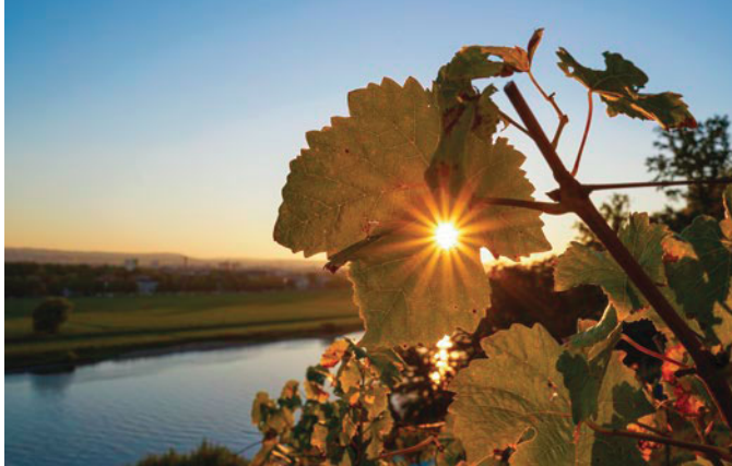
Vineyards on the banks of the Elbe River