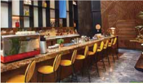
Pullman Lima Miraflores | Lima