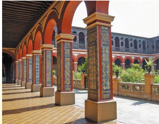
Monastery of Santo Domingo

Ollantaytambo. Explore this Inca hillside fortress renowned for its huge terraces. Next, embark on a scenic train ride through the Sacred Valley to the town of Aguas Calientes and the Inkaterra Machu Picchu Pueblo hotel. Machu Picchu. Nestled in a cloud forest high in the Andes, the Lost City of the Incas is