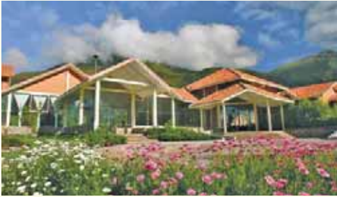
Casa Andina Premium Valle Sagrado | Sacred Valley