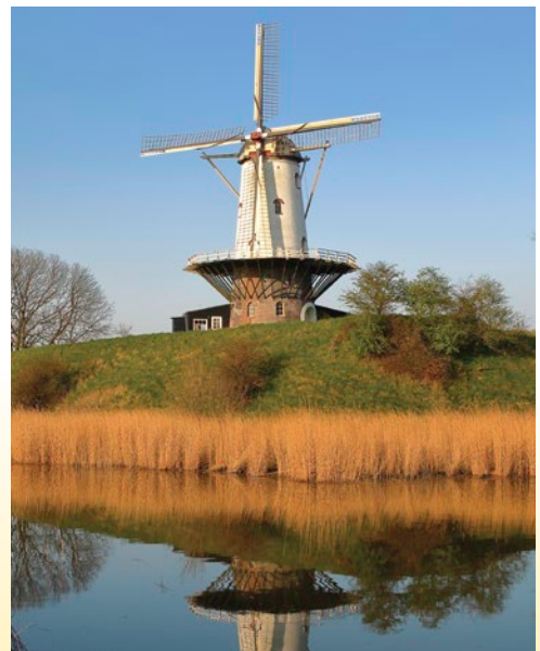
Windmill near Veere

landmass below sea level. Then, experience the impact of the devastating 1953 North Sea flood in a gripping, 4D panoramic animation. The ship remains in Veere overnight.