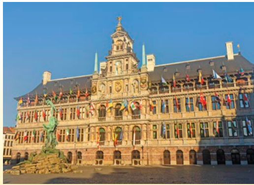
Town Hall, Antwerp