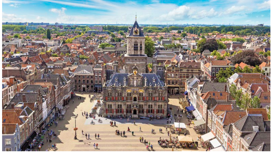
old Town Delft