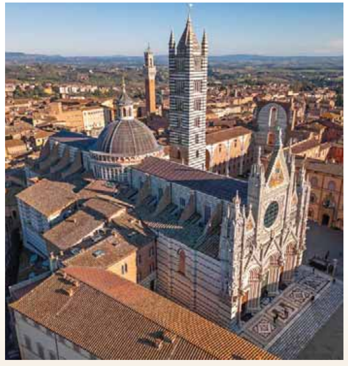
Cathedral of Santa Maria Assunta, Siena