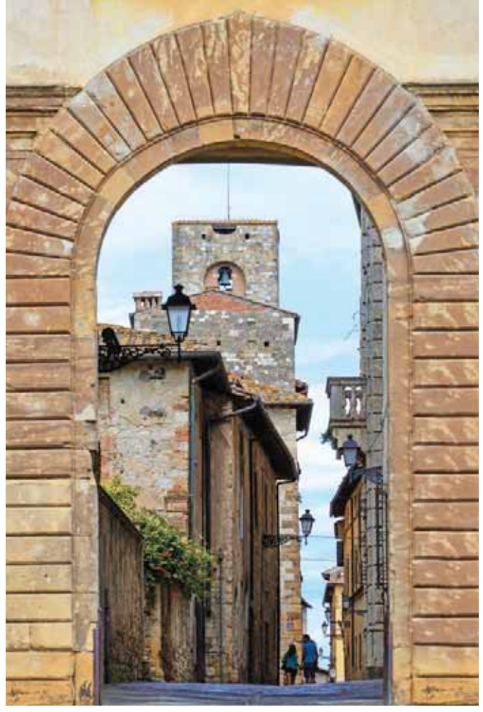
Colle di Val d'Elsa