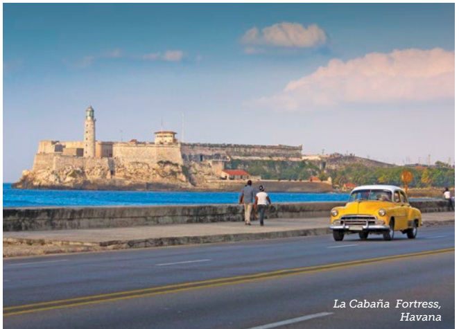
La Cabaña Fortress, Havana