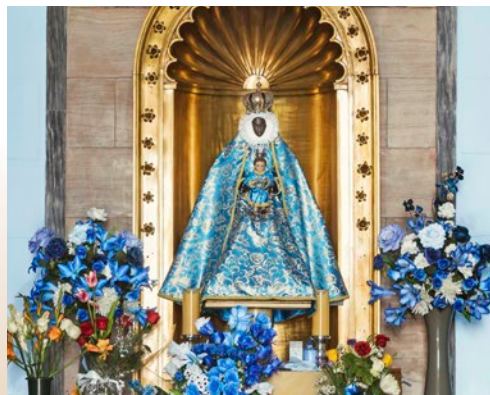
Black Madonna, Iglesia de Nuestra Señora de Regla

Also visit the Sugar Mill Triunvirato, the site of the 1843 Rebellion of the Triunvirato. Then, enjoy a performance by a local choir!