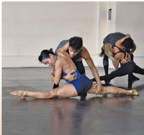
Contemporary Cuban dancers