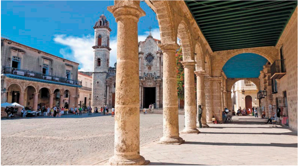
Plaza of the Cathedral, Old Havana