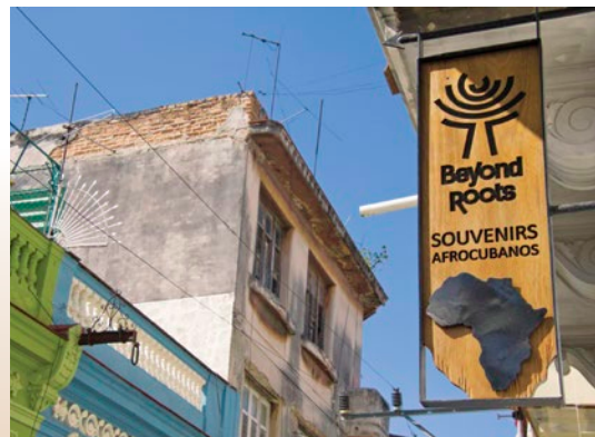
Beyond Roots, Havana

Jewish Center & Cuban Dance. Visit the Sephardic Hebrew Center, where a member of