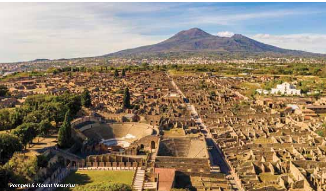
Pompeii & Mount Vesuvius

Nuovo, San Francesco di Paola, Teatro di San Carlo and Piazza del Plebiscito.