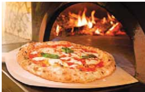
Above: Neapolitan pizza | Below: Olive oil & cheese