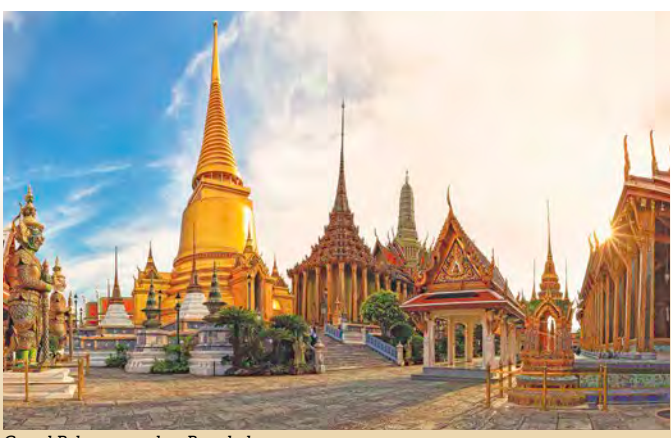
Grand Palace complex, Bangkok