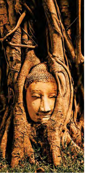
Buddha head, Ayutthaya