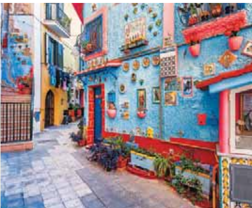
Colorful alleyways of Vietri sul Mare

Enrichment: The Horror and Splendor of Mount Vesuvius. Learn about the tragic effects of the eruption of Mount Vesuvius. This compelling talk provides context for tomorrow's visit to Herculaneum and Pompeii.