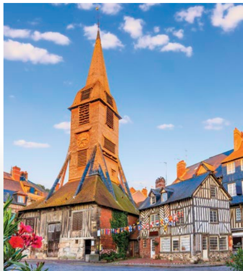
Church of Sainte Catherine, Honfleur

Free Time: Select a special place for dinner. Your Travel Director can assist with planning.