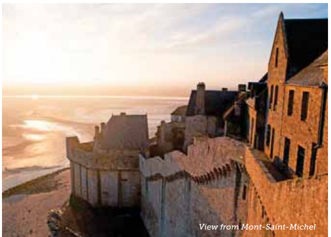
View from Mont-Saint-Michel