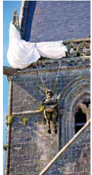
Private John Steele Monument, Sainte-Mère-Église

Knowledgeable Lecturers deepen your appreciation for the region and its history, culture and current events.