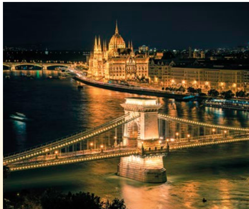
Budapest at night