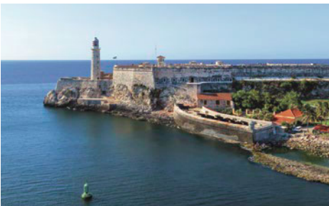
La Cabaña fortress, Havana harbor

This trip is shared by UC alumni from six of the University of California campuses. These shared departures offer a unique and enriching experience that goes beyond the typical tourist journey. Being UC alumni creates an immediate bond and shared sense of community. This common background often leads to deeper connections, fostering friendships and camaraderie during travels.