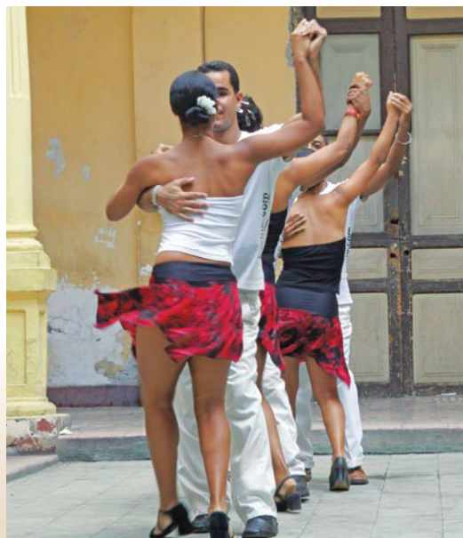
Salsa dancers, Havana