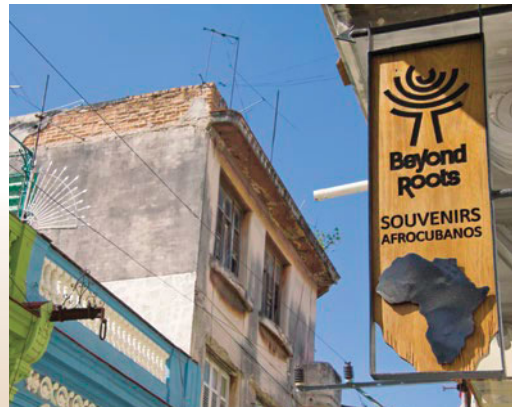
Beyond Roots, Havana

Jewish Culture & Cuban Dance. Visit the Ashkenazi Community Center to gain insight into Cuba's Jewish culture. Stop at Malpaso, a contemporary dance studio. The company will perform a moving dance arrangement for you,