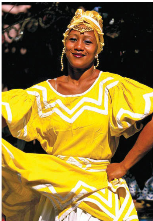
Top: Vintage cars, Havana | Above: Afro-Cuban dancer Cover: Cuban musician | Mail panel: Colonial architecture, Old Havana | Cuban contemporary dancer