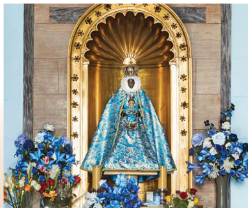
Black Madonna, Iglesia de Nuestra Señora de Regla

stopping at the Museo Farmacéutico building for an a cappella chamber choir performance, followed by a Q&A session with the singers.