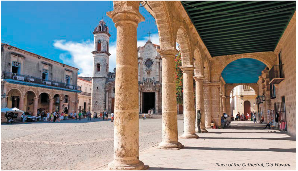
Plaza of the Cathedral, Old Havana