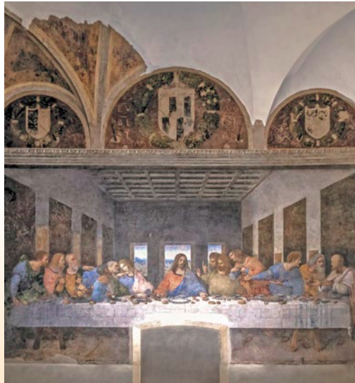
Leonardo da Vinci's "The Last Supper"