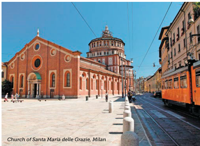
Church of Santa Maria delle Grazie, Milan