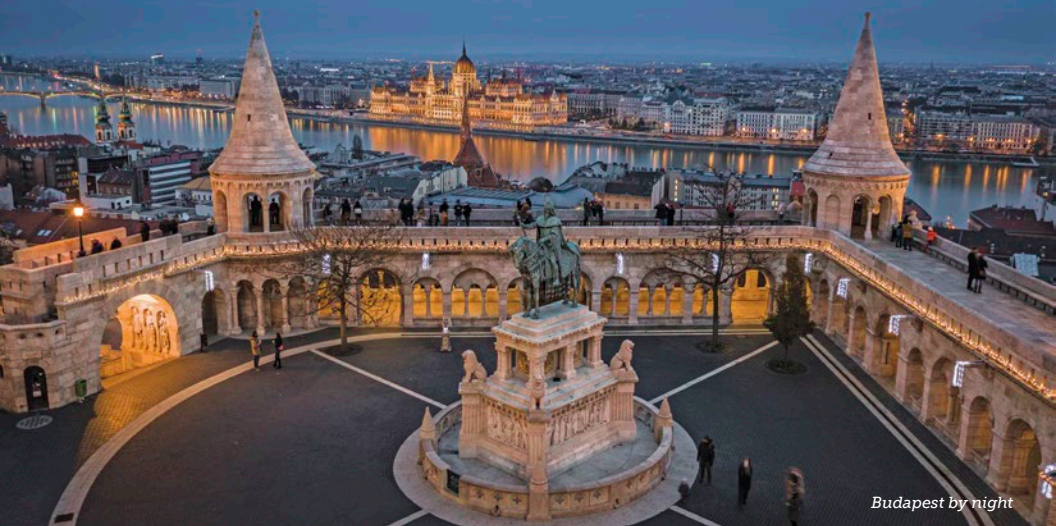
Budapest by night