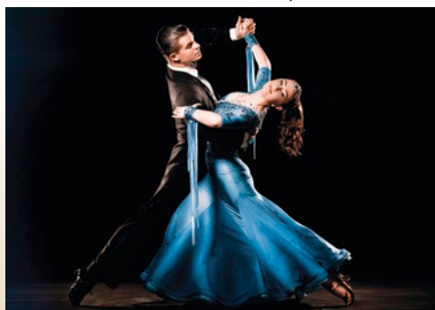
Waltz performance, Vienna