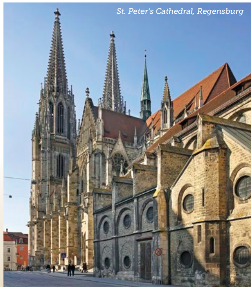
St. Peter's Cathedral, Regensburg