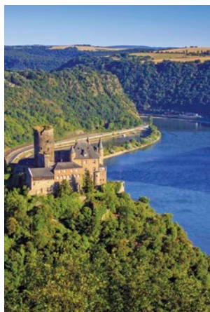
Upper Middle Rhine Valley