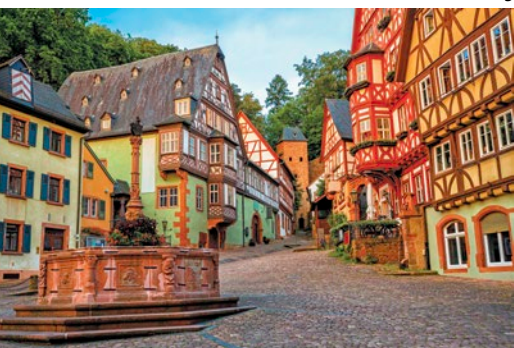
Half-timbered homes, Miltenberg